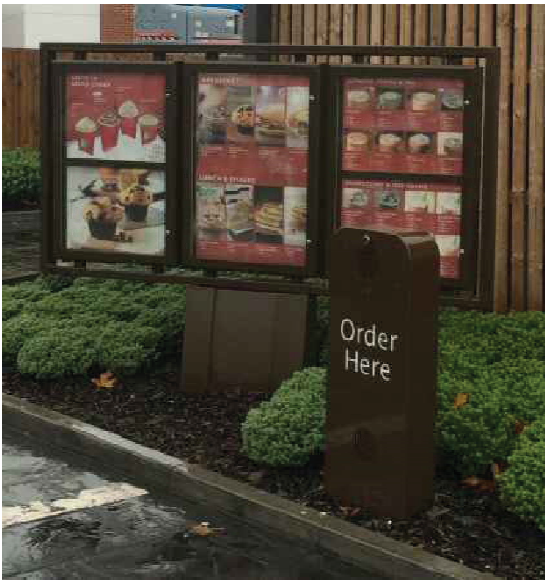
3 panel menu board and speaker post