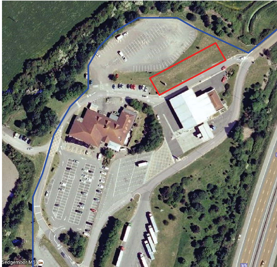
1 Satellite Overlay NTS